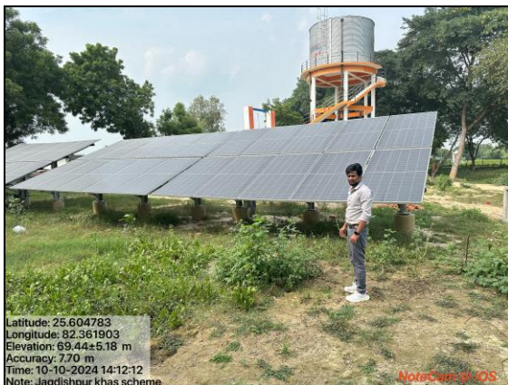
Fig- 1: Solar Plant (16 KW)