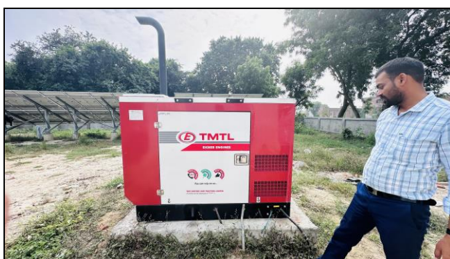
Fig- 2: DG 15 KVA