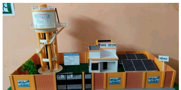
Fig- 6: Project Model