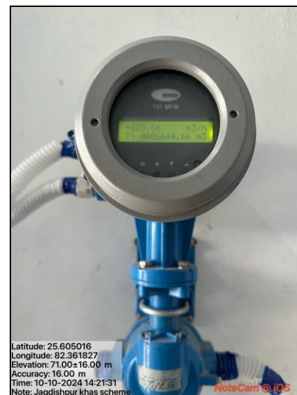
Fig- 5: Flow Meter display